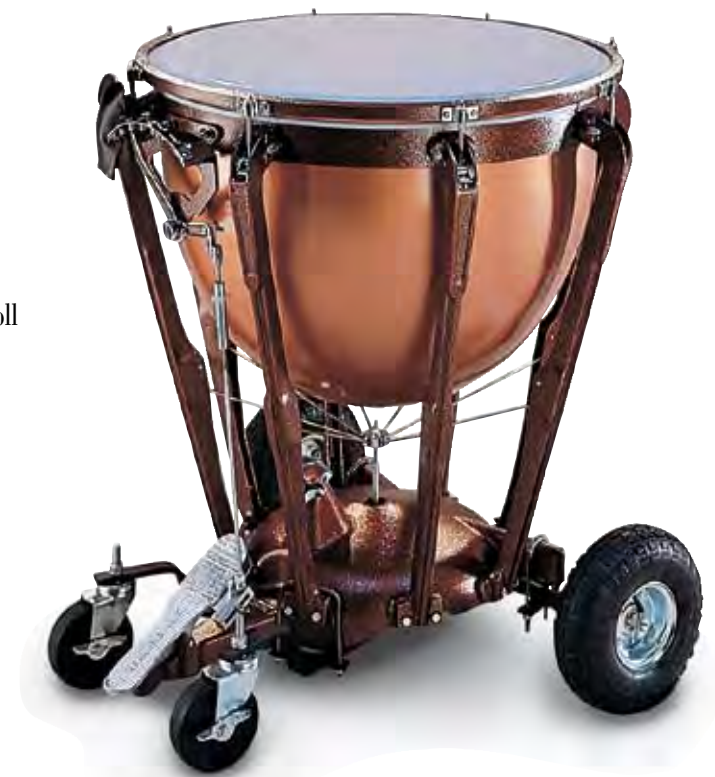
M8007 Timpani Cart Tote System with Pneumatic Wheels. Fits any size Ludwig Timpani except Machine and Universal models.

Timpani Tote Cart is ideal for marching bands and drum corps performances on the field. Even on rough terrain, the timpani roll smoothly. The cart features 10-inch pneumatic back wheels with 5-inch front swivel casters and fits Ludwig Grand Symphonic, Professional and Standard Timpani.