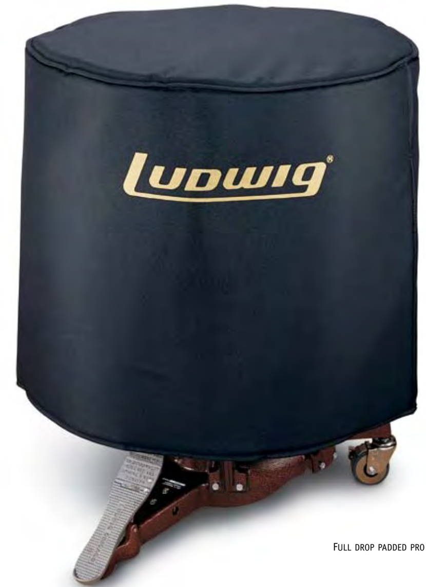
FULL DROP PADDED PRO COVERS.