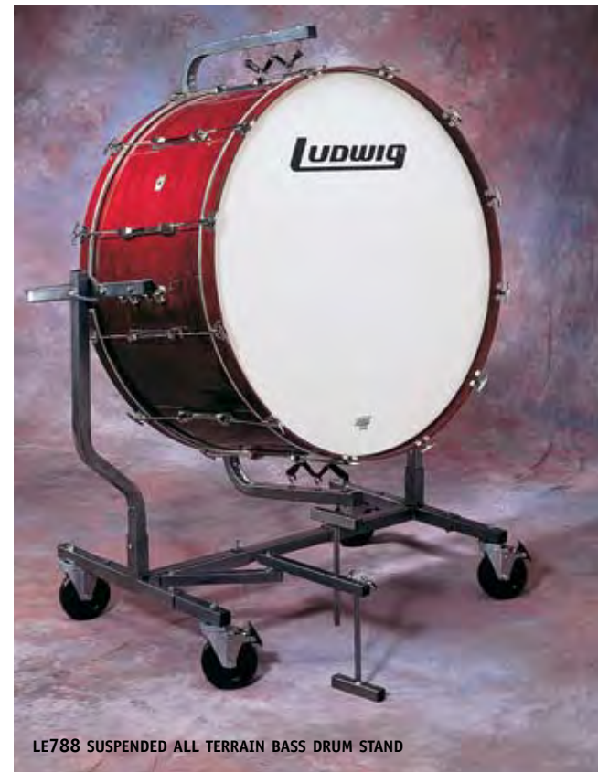
LE788 SUSPENDED ALL TERRAIN BASS DRUM STAND

ADJUSTABLE FOOT REST FOR PROPER MUFFLING TECHNIQUE. STRONG POLY STRAPS SUSPEND THE DRUM FOR MAXIMUM RESONANCE.