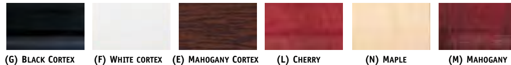
(G) BLACK CORTEX (F) WHITE CORTEX (E) MAHOGANY CORTEX (L) CHERRY (N) MAPLE (M) MAHOGANY