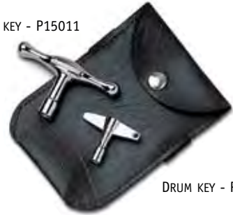
DRUM KEY - P41