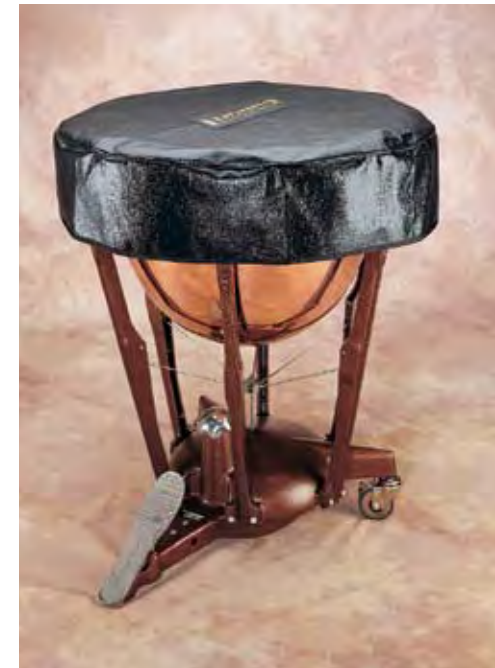
SHALLOW DROP LINED DUST COVERS.