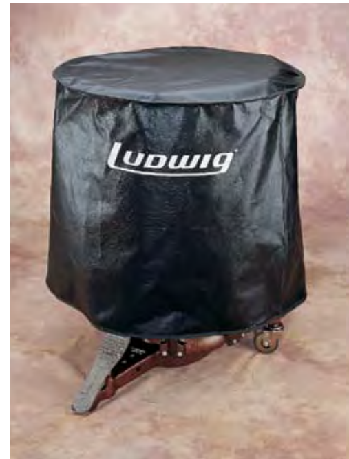
FULL DROP LIGHT DUST COVERS.